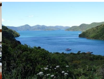
Queen Charlotte Drive