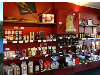
NZ Foods at Pataka